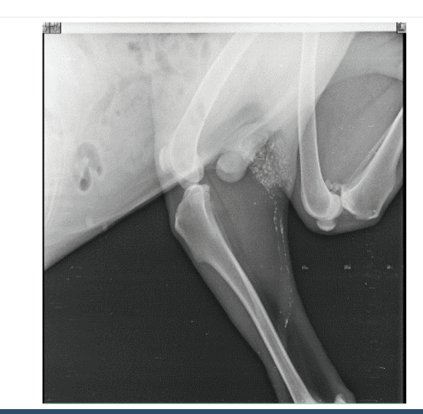
Figure 1: Patchy contrast (Lipidol ultra-fluid) uptake of popliteal LN in case of tumor at the paw of hindleg detected through indirect radiographic lymphography.