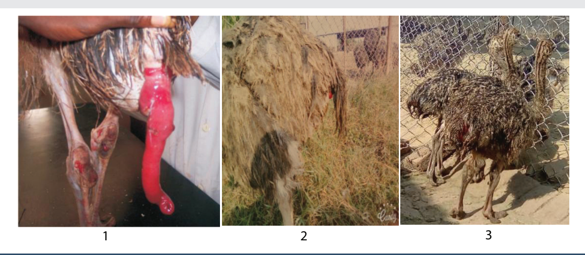
Figures 1-3: Five chicks of age two month faced rectal prolapse problems at once in the ostrich farm.

Blood was collected from the wing vein into Non-Ethylene diaminetetraacetic acid (EDTA) (non-EDTA) vials. The serum was prepared through centrifuging from the blood sample of the non-EDTA vials in the Lab of Ostrich Farm Pvt. Ltd. The sample was sent to Lumbini Zonal Hospital, Rupandehi for analysis.