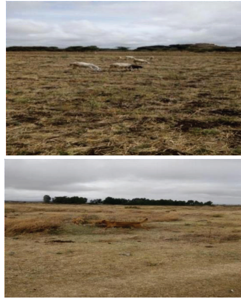
Figure 3: Presence of stray dogs and small ruminants on grazing land.

total infected animals. The average retail market price of sheep and goats brain was 5.75$ from international market. Based on these data, average number of animals slaughtered per annum in five year and percentage of brain/animal condemnation per annum were 324,000 and 6.67%, respectively. Therefore, based on the above information, total financial losses due to coenurosis were calculated by using the formula indicated under study design: