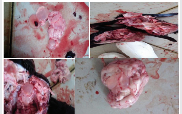
Figure 2: Positive brain containing with coenurosis cysts during sample collection.

of dog food, 100% respondents agreed the food of dogs from leftover and not agreed on scavengers.