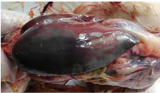
Figure 2: Hepatic congestion with black discoloration.

The day after the birds were fed a ration containing 70% tofu skin waste, mortalities increased significantly (RR 237.3; 95%CI 33.3–1690.5) compared with when no tofu skin waste was fed (4 th August) (Table 1). There was a strong correlation between the number of dead geese and the percentage of tofu skin waste fed in the previous evening ( r=0.85 , p<0.02 ). The above clinical comprehensive diagnosis results indicated that tofu skin waste was the real dangerous cause of goose poisoning.