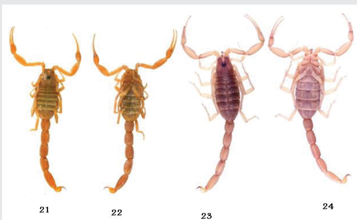
Figure 21,22: Compsobuthus jakesi , dorsal and ventral views, ♂ (28 mm) paratype, Iraq, Najaf Province, Ash-Shabakah (Shabachah, Shabicha), 262 m, 31°06'N 43°95'E.