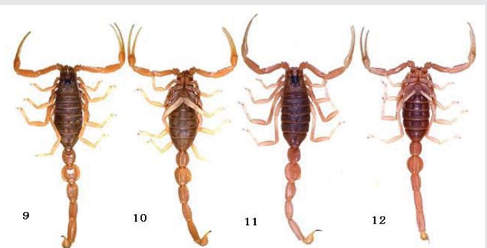
Figure 9,10: Apistobuthus susanae, ventral and dorsal views, ♂ (76 mm), Iran, Ilam Province.

Figures 7,8: Polisius persicus Fet, Capes & Sissom, 2001 ventral and dorsal views, ♂ im. (22 mm), Iran, Ilam Province.