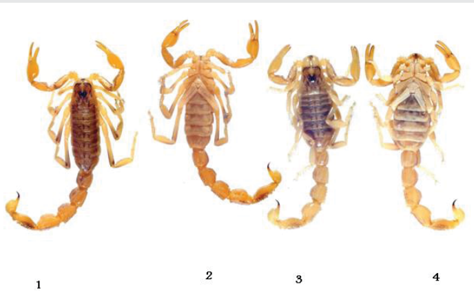
Figure 1,2: Kraepelinia palpator [8], ventral and dorsal views, ♂ (32 mm), Iran, Kerman Province, Jupar road, 30°07'25"N 57°11'26"E, 1819 m a.s.l. (Locality No. KE-29),

Figures 3,4: Kraepelinia palpator [8], dorsal and ventral views, ♀ (30 mm), Iran, Kerman Province, Jupar-Kerman road, 30°10'48"N 57°03'02"E, 1788 m a.s.l. (Locality No. KE-110).