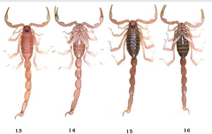
Figure 13,14: Buthacus macrocentrus , dorsal and ventral views, ♂ (69 mm), Iran, Khoozestan Province, Hamidiyeh, 31°27'57"N 48°29'18"E, 13 m a.s.l. (Locality No. A-Ham-812-2), FKCP.

Bushehr province material examined: Iran, Bushehr Prov., cca 17 km NW. Bandar-e Genaveh, 10m a.s.l., 29°38'32"N 50°26'56"E, 1♂ FKCP, 13–14.X.1998, leg. P. Kabátek; Bandar-e Genaveh env., X.2000, 2♂ FKCP, leg. R. Perlík; Delvar,