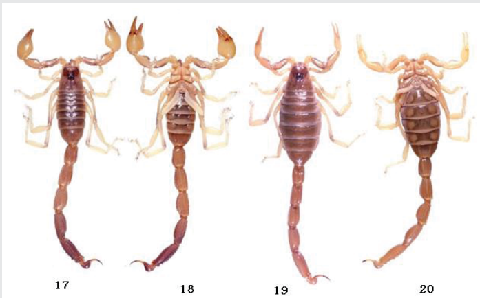
Figure 17,18: Vachoniolus iranus ventral and dorsal views, ♂ (42 mm) holotype, Iran, Khoozestan Province.